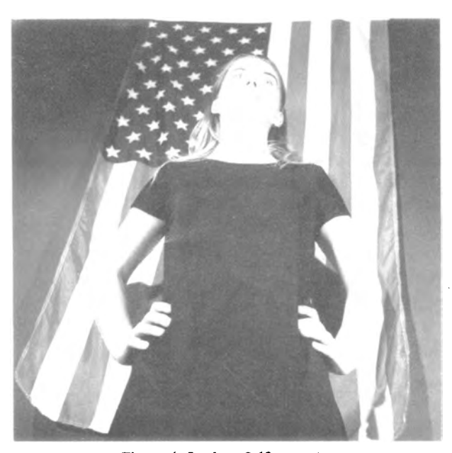
Figure 4. Student Self-portrait

When people look at me, I want them to look up at me - not because I think that I am better than them but because I have earned respect throughout my life. I want people to see me and say, "Wow - there's someone who did something with their life." In this picture I am portraying a proud, white, upperclass American woman in a respectable, powerful position.