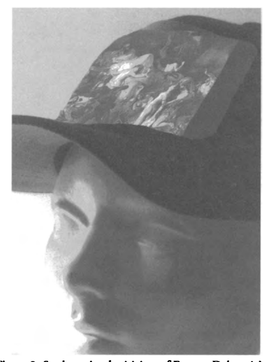
Figure 2. Student visual criticism of Eugene Delacroix's Death of Sardanapalus, Giraudon/Art Resource, NY