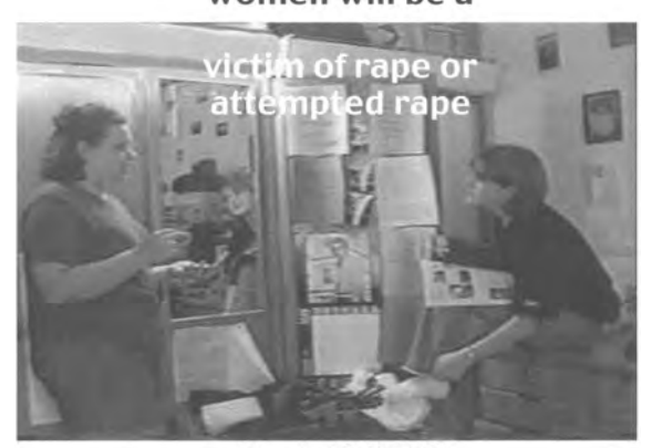
the RED ZONE is the period between the first day of class and thanksgiving