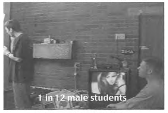
have committed acts that met the legal definition of rape